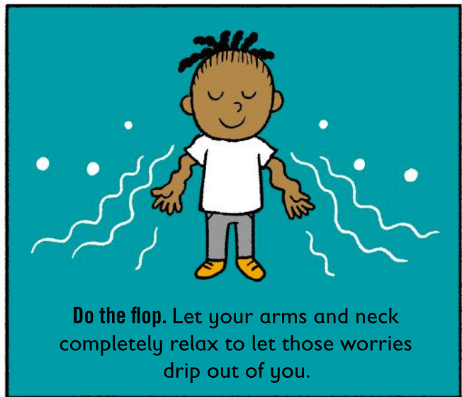
Do the flop. Let your arms and neck completely relax to let those worries drip out of you.