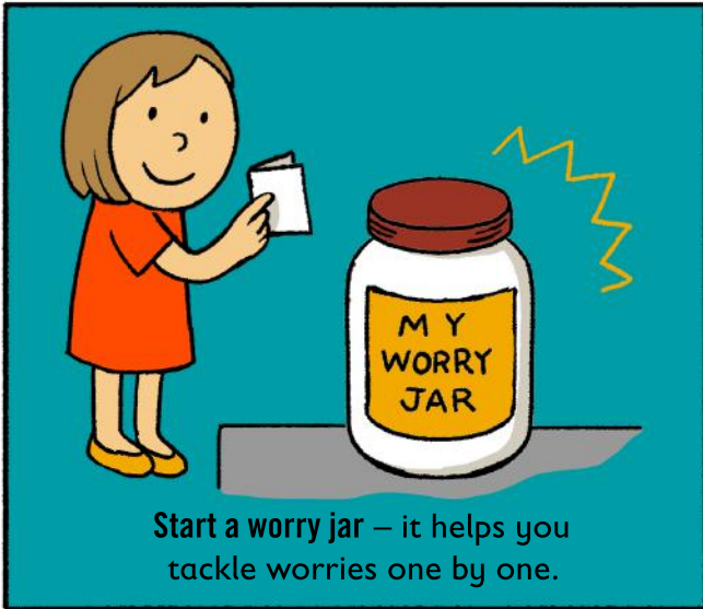
Start a worry jar – it helps you tackle worries one by one.

Try to figure out what you're worried about and talk to an adult you trust about it. Try some of these, too: