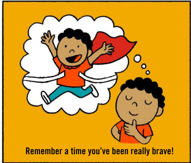
Remember a time you've been really brave!