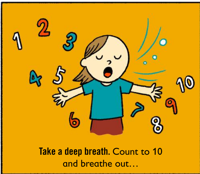
Take a deep breath. Count to 10 and breathe out...