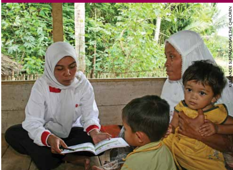
KULLIYADEE SUMNALOP/SAVE THE CHILDREN

Source: Women on the Front Lines of Health Care: State of the world's mothers 2010 , Save the Children