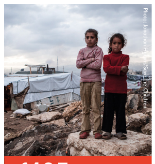
£105 could buy a kit to help a family living as refugees to protect their shelters against the weather.