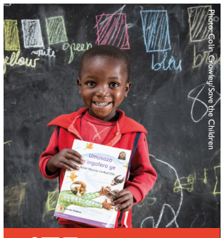
£75 could provide everything needed to run a reading club to help children learn literacy for a year.