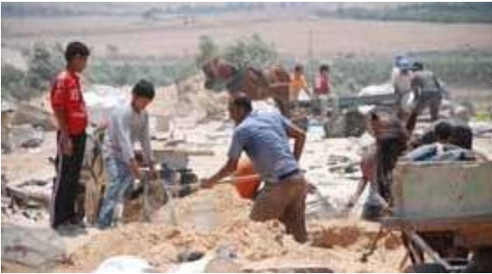
Palestinian men collect gravel from destroyed buildings in Gaza, here near the Erez crossing, close to the Israeli "security zone".

On June 20, 2010, following concerted international pressure, the Government of Israel announced a set of measures to 'ease' its illegal blockade of the Gaza Strip. This included: