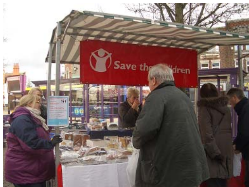
Loughborough Market sales