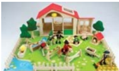
My Riding Club

Fact: Children love toys. So take a look at these lovely wooden toy sets. Save the Children is able to offer these beautiful toys to branches to buy or perhaps take into schools as raffle prizes or gifts. There is a considerable stock available, all of which retails at between £19.99 and £49.99 but the retail warehouse may be willing to donate them to Save the Children free of charge.