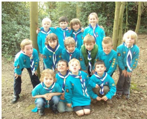
Berkswell Beavers get into the spirit of

No, not those kind of beavers but Coventry's Berkswell Beavers. The group of Beavers went door to door around Balsall Common collecting money during Save the Children Week. They managed to raise a brilliant £62.