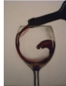
A selection of the art donated