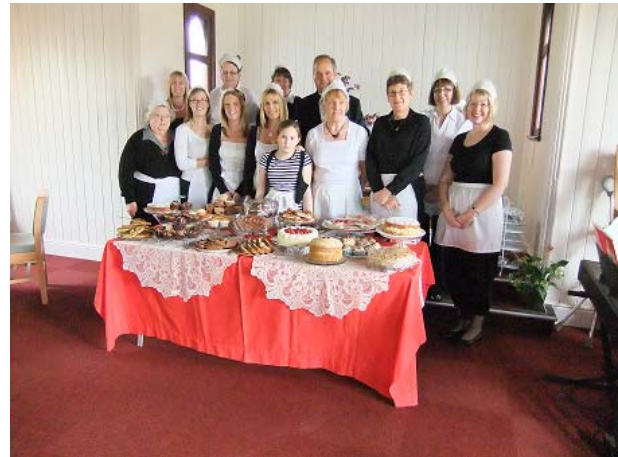
Kettering proudly displays their high tea

In aid of Save the Children Week Kettering branch held a 'Tea at the Ritz' event with support from the congregation of St. Michael's Church who provided the venue and donated cakes. Traditional china tea sets were used and they even invited a pianist along to the event which raised £500.