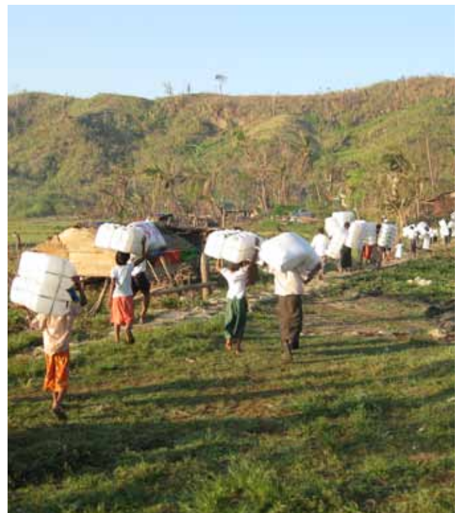
Distribution of non-food items

Save the Children has developed practical ways to ensure accountability in our response, based on the experience piloted in Nargis and our agency commitment to HAP Standards. The Giri response teams have included dedicated accountability officers who manage information centres, generally alongside food and NFI distribution points, to ensure a centralized, staffed space to receive and respond to questions and complaints. This system enables children and their families to give suggestions and feedback and provides a structured way for Save the Children to listen and answer questions. In order to ensure both children and adults are able to provide feedback, children were also encouraged to colour pictures on feedback cards representing their concerns, requests or thoughts. Community feedback was used to alter the content of the NFI kits in the early stages of the response, in particular to increase children's recreation items.