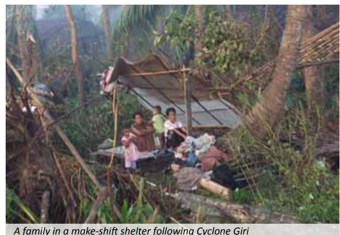
A family in a make-shift shelter following Cyclone Giri

Cyclone Giri swept over Rakhine State two and a half years after Cyclone Nargis devastated the Ayeyarwady Delta. Although Nargis affected around ten times the number of people (around 2.4 million), the death toll resulting from Cyclone Giri was only a fraction of that experienced during Nargis, partly a result of better early warning, and