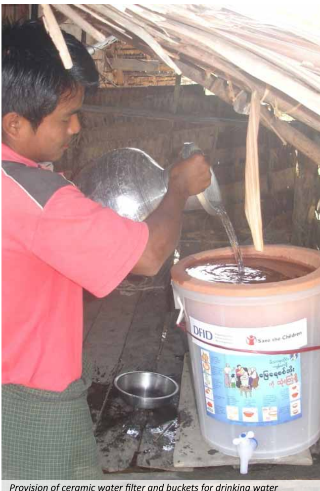
Provision of ceramic water filter and buckets for drinking water

Infant Feeding Support Kits were distributed to 200 pregnant and lactating women. 1759 pregnant and lactating women attended the Infant Feeding Support Sessions. The intervention was funded by UNICEF (CERF), Dean and Deluca, and Save the Children.