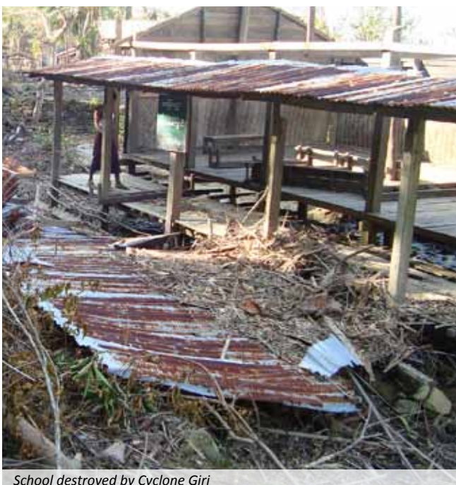
School destroyed by Cyclone Giri

As with the response to Cyclone Nargis it is important to register the experience of the last 6 months has again demonstrated that despite the challenges of working in Myanmar, large scale humanitarian assistance can be provided effectively and independently. There has been enough political and humanitarian space to allow for Save the Children's response to be designed and delivered according to its own principles, and to the priorities of the communities with which it has worked.