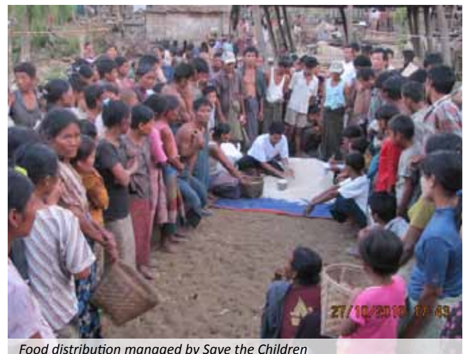
Food distribution managed by Save the Children