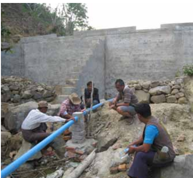
Dam construction enabling water distribution of 30,000 litres per day

The early focus of the Save the Children response was on water provision to villages where water sources (generally ponds or wells) were washed out or otherwise damaged during the storm. The primary target has been 7,300 people in six villages in south-eastern Myebon islands which, unlike most of the other coastal areas, are entirely flat and therefore have no spring source. Drinking water delivery to this population will continue through until the onset of the monsoon. In December, in a remarkable feat of ingenuity and determination, Save the Children staff and local volunteers constructed a four-metre high concrete dam on the island of Ngwe Twin Tu. The dam stored water from a vigorous spring source, and a gravity-fed 1km long pipe channeled this to a shore-side storage and distribution site, where four bladders (ex Nargis) trans-shipped the water into smaller