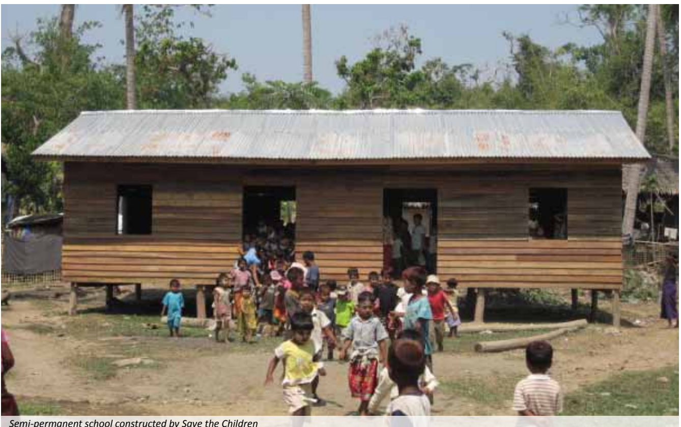
Semi-permanent school constructed by Save the Children

Nine communities were selected for the introduction of Child Led Disaster Risk Reduction (DRR) activities, which included awareness raising on risks and small grant funding for risk mitigation action plans. The actions included small bridge and jetty repair to improve transport and communications.