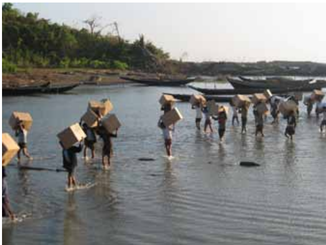
Distribution of non-food items

Working closely with the Paung Ku team and distributing short term food and non food relief assistance throughout the period of assessment and initial set up, Save the Children was able to provide assistance, albeit often limited, to 135,000 affected people, including an estimated 54,000 children.