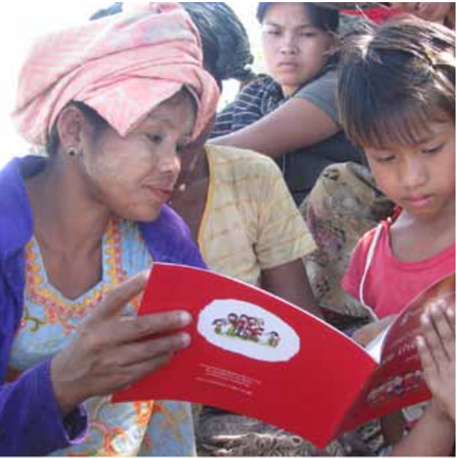
Books explaining mandate & background of Save the Children

volunteer workers have been trained by Save the Children and are actively involved in each community. These spaces provide children with protected environments in which they participate in organized activities to play, socialize, learn, and express themselves as they rebuild their lives and regain a sense of normality.