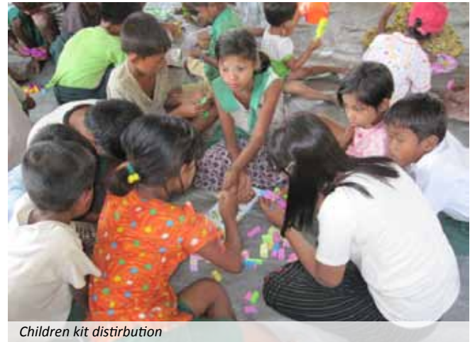
Children kit distribution

In the aftermath of cyclone Giri 30,000 children under the age of five and 12,000 pregnant or lactating women were at immediate risk in the event of a decline in nutrition status. Rapid assessments conducted post-Giri indicated vulnerability and highlighted the importance of Infant and Young Child Feeding (IYFC) practices, where data showed low exclusive breast feeding