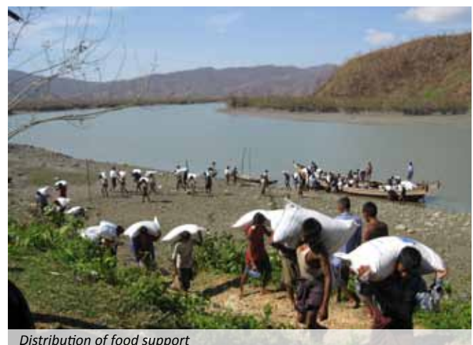
Distribution of food support