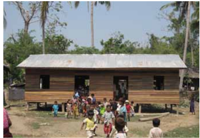
Semi-permanent school constructed by Save the Children

Six months on from Cyclone Giri, township centres have recovered remarkably quickly from the Cyclone. In contrast to the scenes of devastation