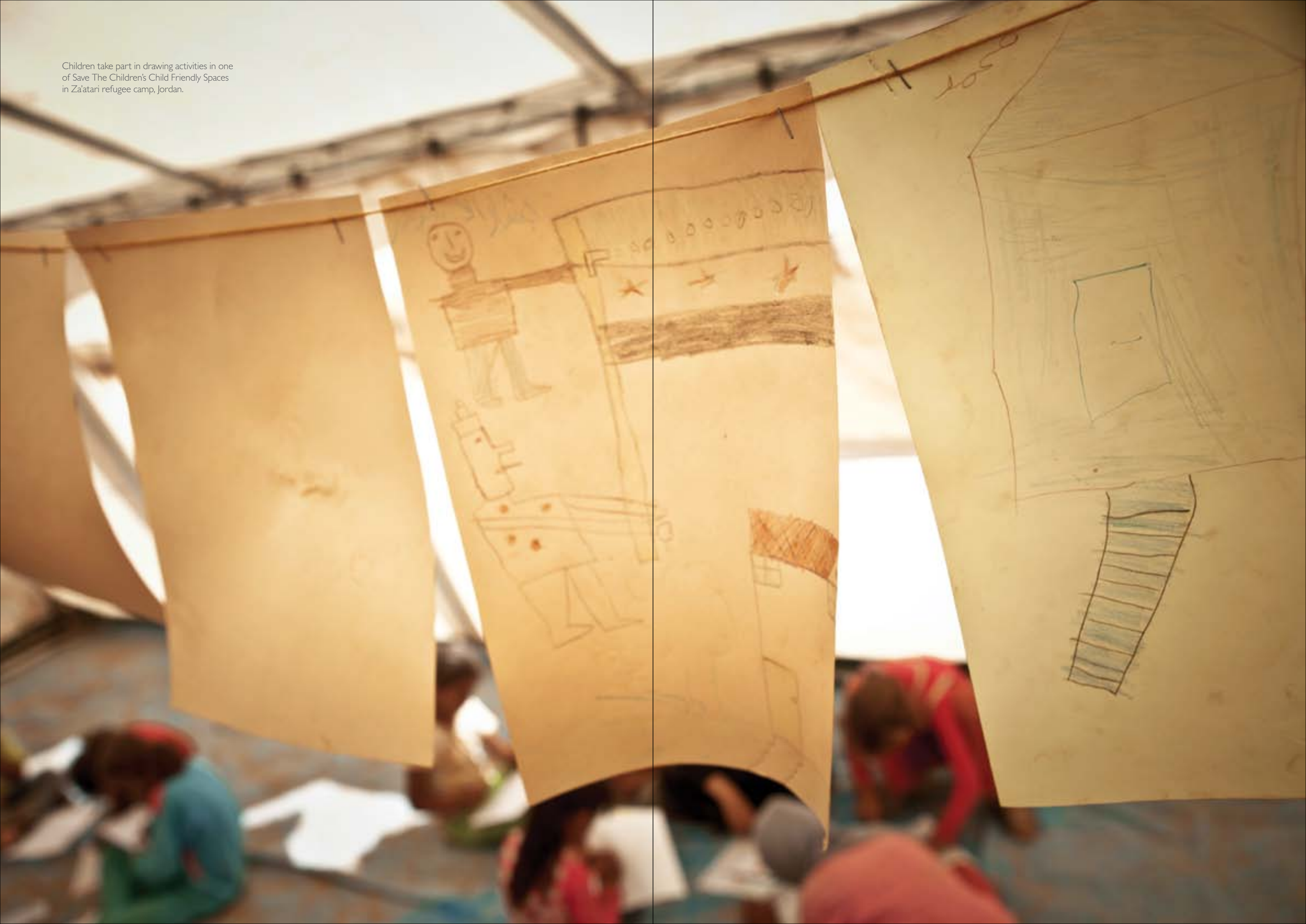
Children take part in drawing activities in one of Save The Children's Child Friendly Spaces in Za'atari refugee camp, Jordan.