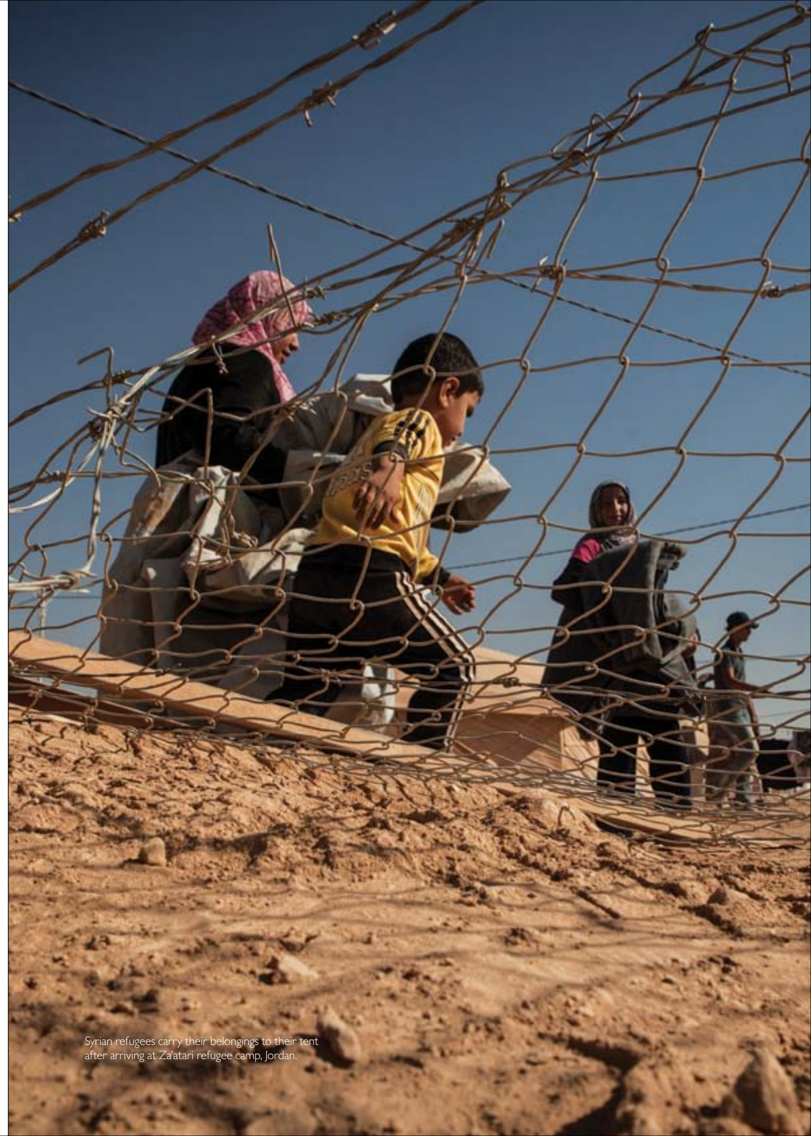
Syrian refugees carry their belongings to their tent after arriving at Za'atari refugee camp, Jordan.

Now, in my sleep, my friends tell me that I shout for my mother and sometimes scream “Leave me alone! Leave me alone!”