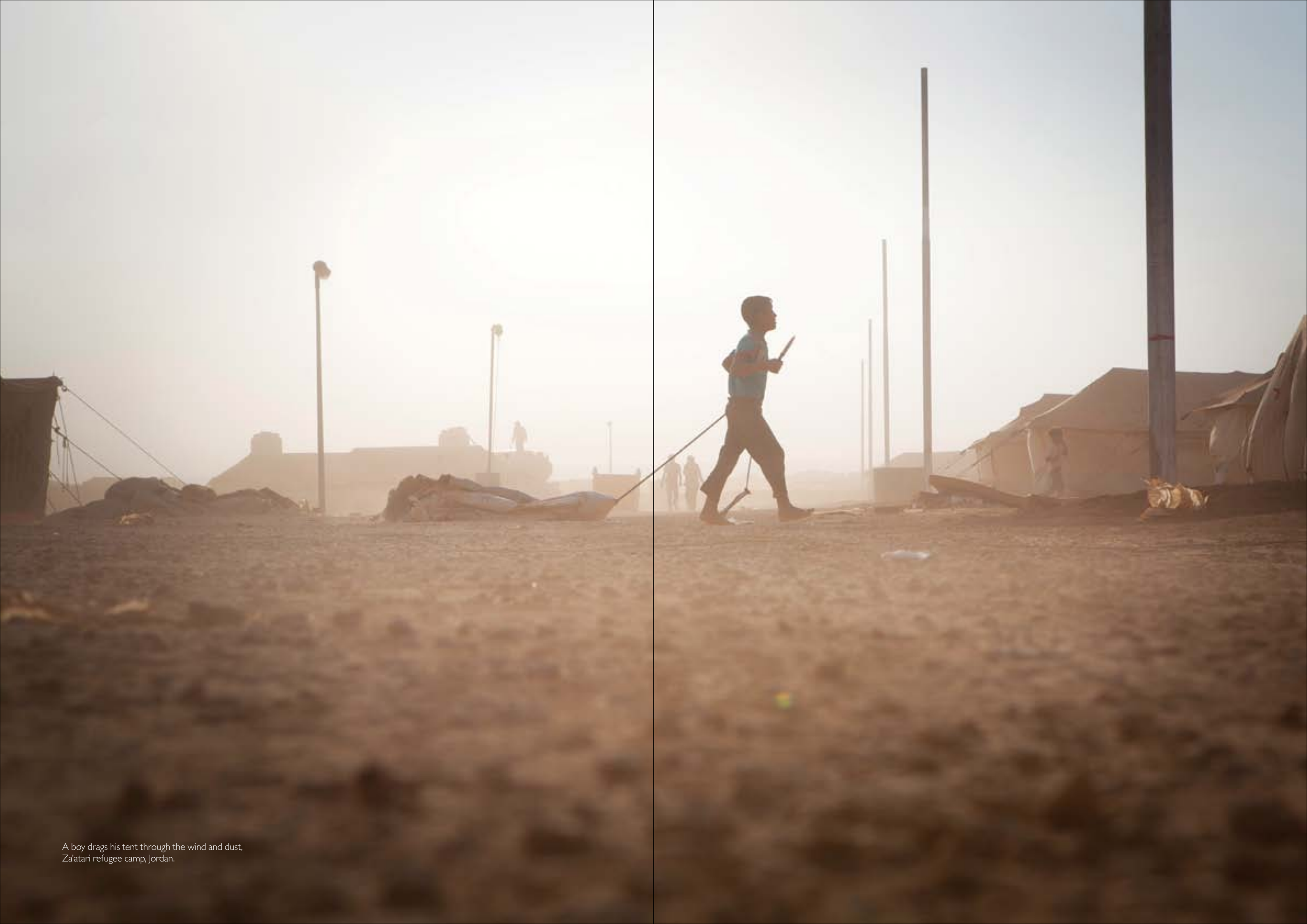
A boy drags his tent through the wind and dust, Za'atari refugee camp, Jordan.