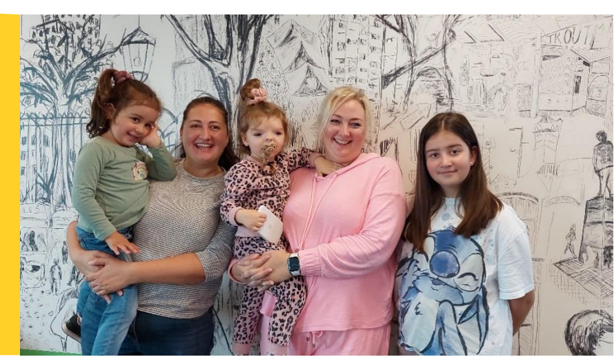
*Names have been changed to protect identities.

Working alongside our partner in Cardiff Council, Save the Children Cymru were able to provide them with an early years grant to buy books and toys for the children and vouchers to buy food and clothes.